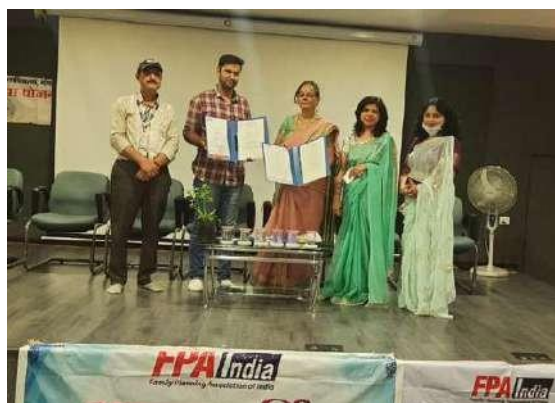
Date of MoU : 27-09-2021

The MoU with FPAI represents a strategic partnership dedicated to advancing reproductive health rights, empowering communities, and improving health outcomes for all.